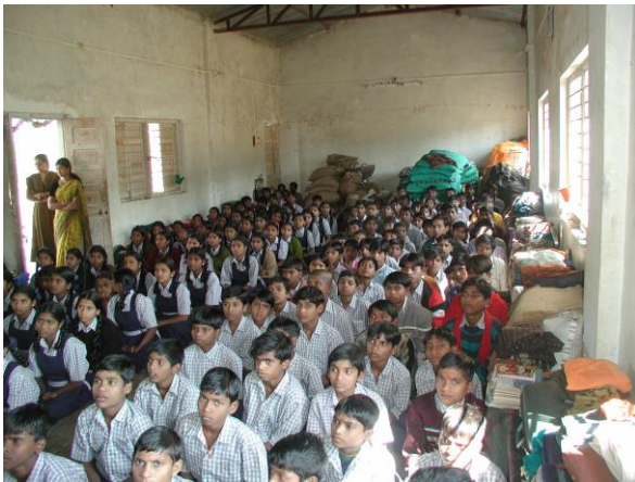
Saputara School in Tribal area